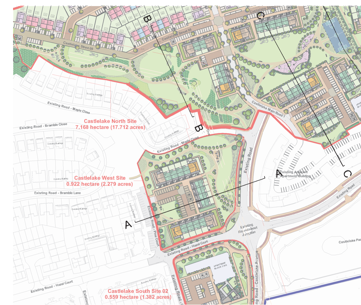
Castlake North & West Sites